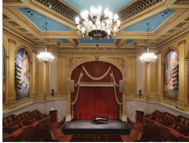
Herbst Theatre 401 Van Ness Avenue Located inside the War Memorial Veterans' Building