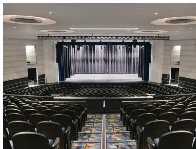
Presidio Theatre 99 Moraga Avenue in the Presidio of San Francisco Across from the bowling alley and 3 blocks from Tunnel Tops