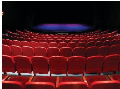
Margaret Lesher Theatre 1601 Civic Drive Located within the Lesher Center for the Arts